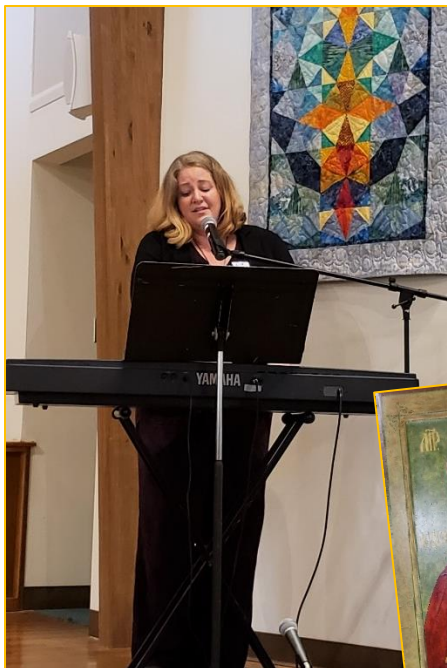
Spring Gathering 2019 Trinity Presbyterian Church